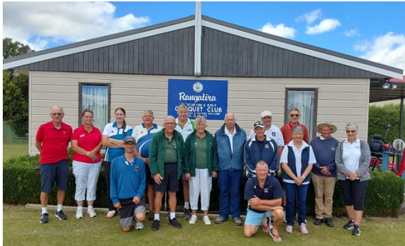
Participants Inaugural Eastern vs Western regions competition.

worker as a referee and referee coach and examiner.