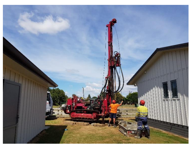
Drilling Rig in Position!

There has been quite a bit of work going on at the Matamata Croquet Club of late. After this very dry summer that left lawns 'brown as a desert' the club decided something needed to be done, especially if it wanted to be able to hold national and international tournaments during the coming summer.