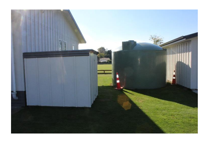
The tank has been installed.

Matamata asked other clubs what they did, consulted with council, as well as their lawn keeper. As a consequence, the photos demonstrate what has appeared at the club, complete with sinking a well and installing a tank. This is Stages 1 and 2 completed. This will enable the club to give the lawns the watering they need, when they need it, and not take much needed water from the town supply. This is great news as Croquet New Zealand has penciled Matamata in for a national tournament next summer and an international tournament the following year.