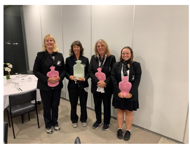
Kiwi ladies with their secret weapons to combat the freezing conditions.

The lawns at Cairnlea were turning out to have some quite unique characteristics with interesting slopes to be aware of. That said, the lawns were in excellent condition and certainly of a quality to match and challenge the skills of players taking part.