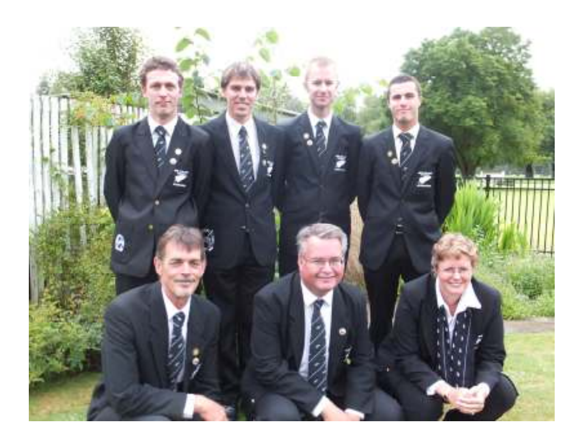
Croquet New Zealand Level 5 Compudigm House, 49 Boulcott St, PO Box 11 259, Wellington