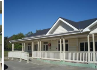
The new croquet club at Levin.