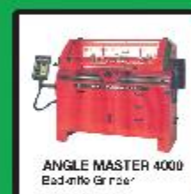
ANGLE MASTER 4000 Bedknife Grinder