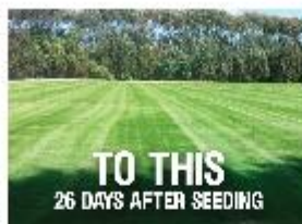
TO THIS 26 DAYS AFTER SEEDING