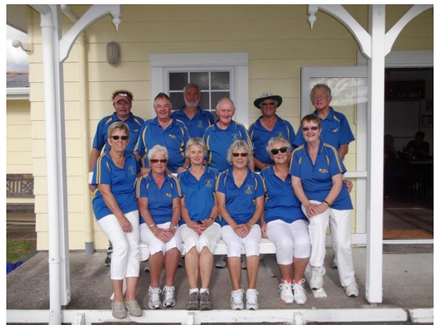
Bay of Plenty Team