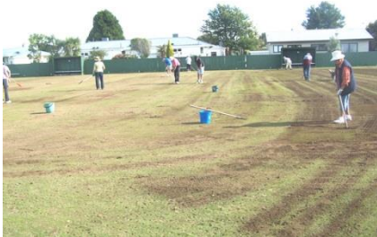
Members working hard filling holes

The club has closed for 2 weeks as a major coring programme is taking place. All 6 courts have been cored and with players having swapped their mallets for rakes, a huge exercise of filling in holes is taking place. We are very lucky to have so many members coming along at different times to help with this project, not only providing manual work but also supplying wonderful refreshments for morning and afternoon teas.