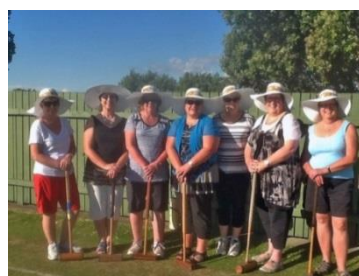
"Flat whites" and "Cappuccinos"

It is always delightful, as happens often, to hear players say "Is this the sixth week already? When does the next one start?"