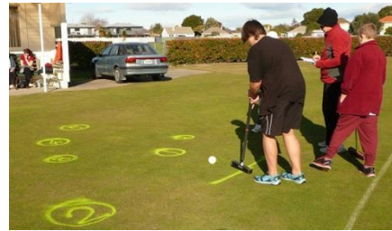
Connor Parkhill and Hamish Whyman at target activity which proved the most difficult activity of the day

Hamish Whyman, Tamatea Intermediate, impressed with a long distance hoop, the ball whisking through without touching the sides.