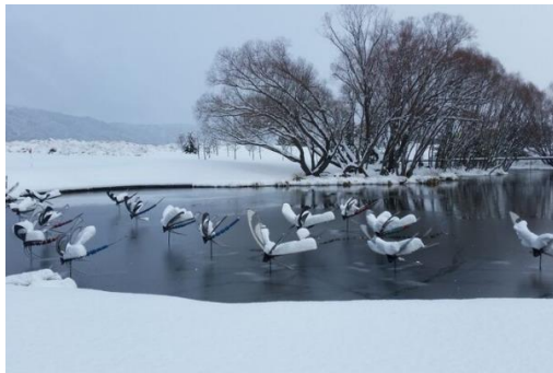
Winter at the Michael Hill Golf Course – frozen fountains