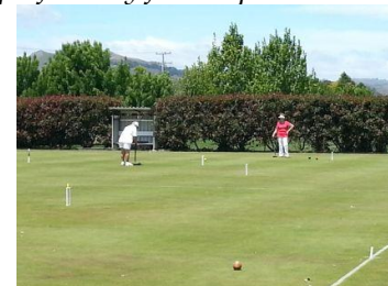
Not every day is perfect for croquet