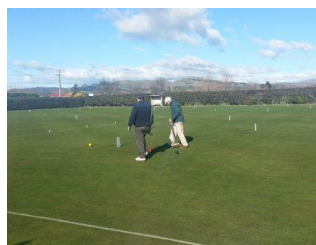
A perfect day for croquet