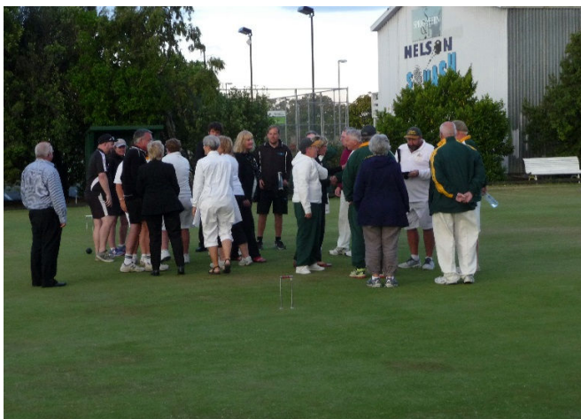
Players celebrating and commiserating