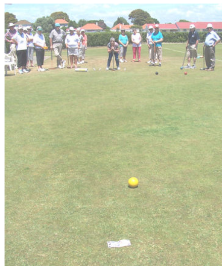
The $50 challenge!