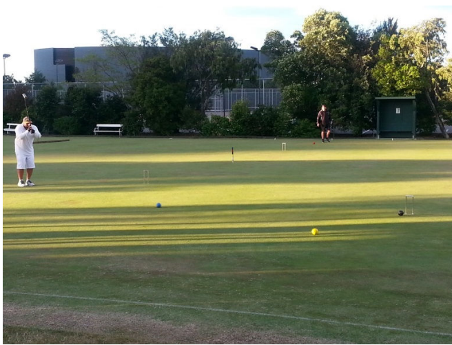
Long shadows for the end of the final game