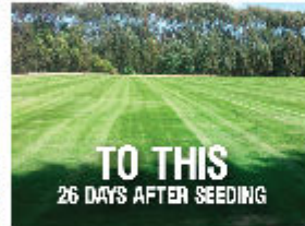
TO THIS 26 DAYS AFTER SEEDING