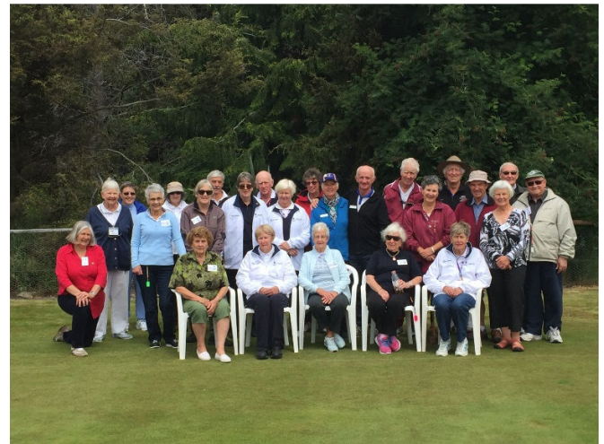
Group Photo: 11 of 12 Wakatipu CC Players with 14 Australian Touring GC Players