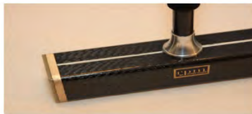
RPM Victory (Carbon Composite)