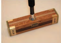
RPM True Balance