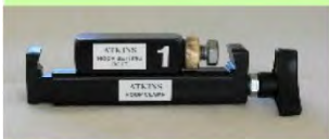
Setting bolt & clamp