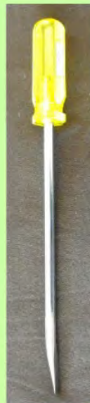
Hoop hole scraper

https://sites.google.com/site/atkinscroquet email: atkins.quadway@gmail.com