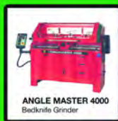
ANGLE MASTER 4000 Bedknife Grinder