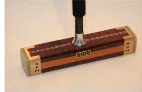
RPM True Force