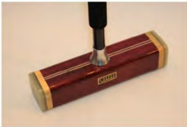
RPM GC Max