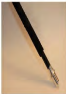
Easy remove Carbon Shaft Handles