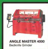
ANGLE MASTER 4000 Bedknife Grinder