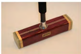
RPM GC Max