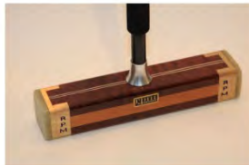
RPM True Force