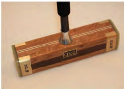
RPM True Balance