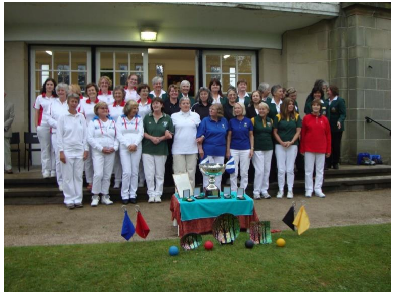
The combined participants at the closing ceremony