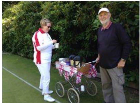
Tea time – Kelburn club used to have a tea pram just like this