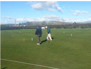
A perfect day for croquet