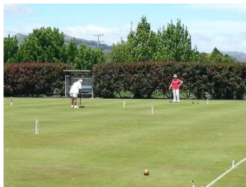
Not every day is perfect for croquet