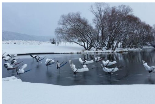
Winter at the Michael Hill Golf Course – frozen fountains