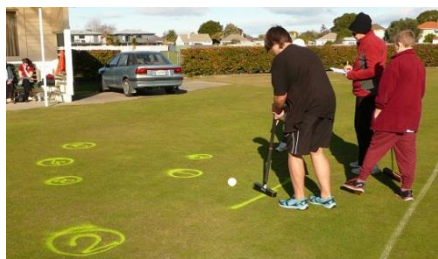
Connor Parkhill and Hamish Whyman at target activity which proved the most difficult activity of the day

Hamish Whyman, Tamatea Intermediate, impressed with a long distance hoop, the ball whisking through without touching the sides.