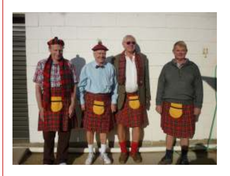
Some of our local lads

Visitors from the winterless north (ie Doubtless Bay) get a brrrrrrr welcome at Matamata on the 3<sup>rd</sup> July.