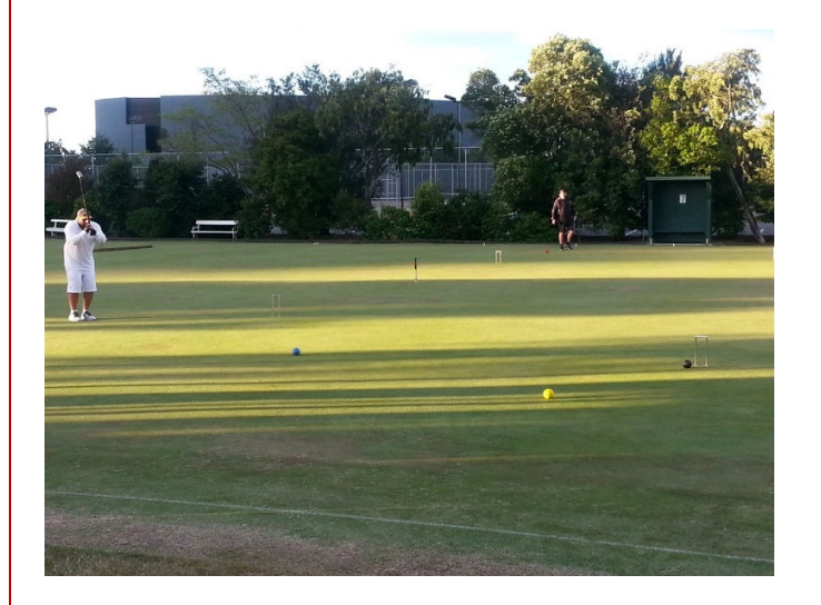
Long shadows for the end of the final game