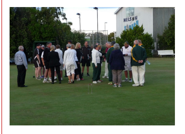
Players celebrating and commiserating