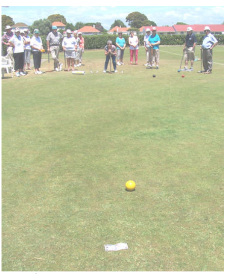
The $50 challenge!